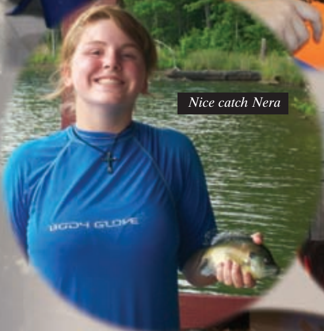
Nice catch Nera