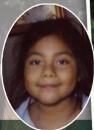
7 years old