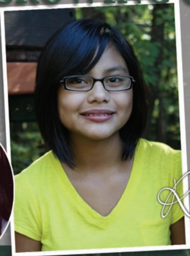
13 years old